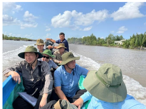
Photo: Checking Project 47-DCCT in the flooded area of Ca Mau peninsula