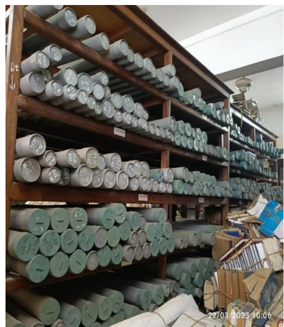
Document preservation and document checking at the Center

The warehouses are always kept neat, clean, and termite-free. The Archive is protected 24/7, including days off and holidays, ensuring absolute safety for documents, preventing fire, explosion or loss.