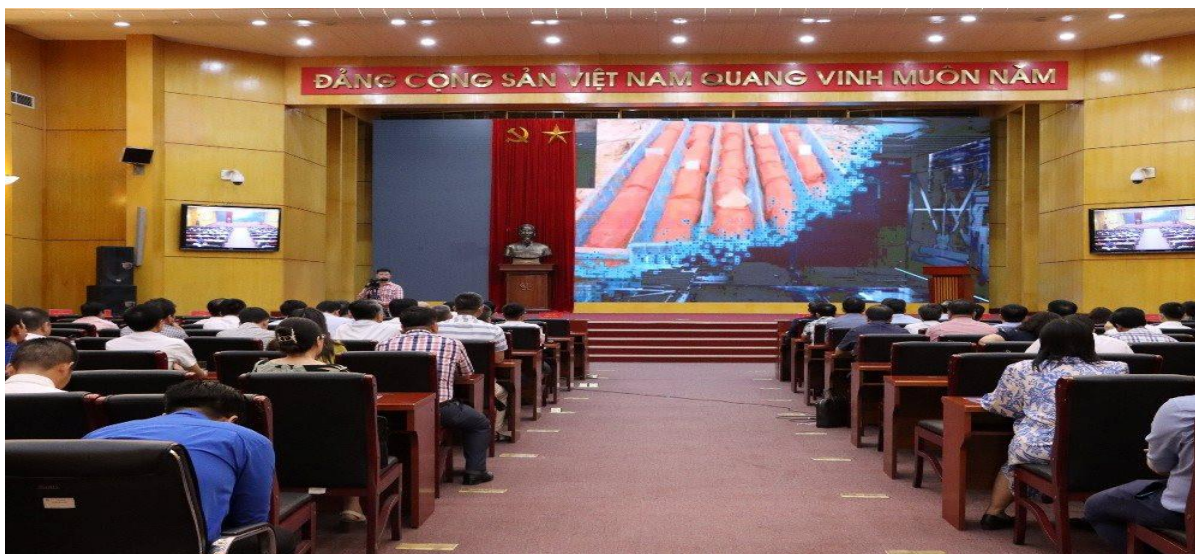
Photo: Conference scene

To successfully implement the Planning for basic geological surveys of minerals for the period 2021-2030, with a vision to 2050 approved by the Prime Minister, the Ministry of Natural Resources and Environment hopes to receive the attention of the Government. Government, cooperation of relevant ministries and branches in the process of implementing planning tasks in the areas.