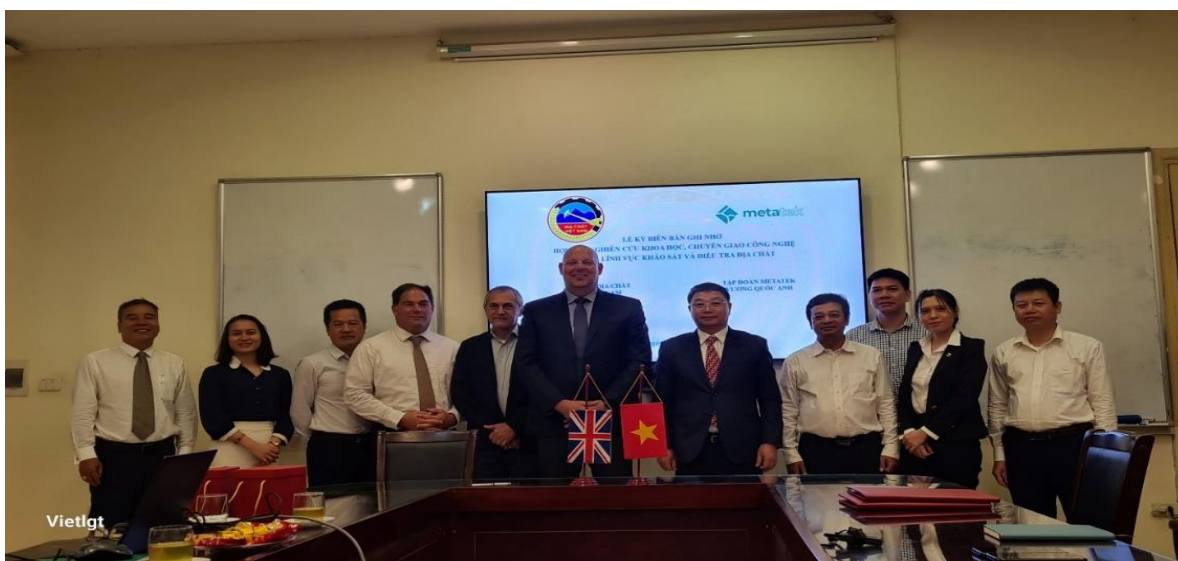
Photo: Signing the METATEK-UK Memorandum of Understanding

Develop and sign a Memorandum of Understanding (MOU) with partners with the contents of technical support and technology transfer for deep-sea mineral assessment; assessment of hidden minerals, important minerals, strategies for energy transition, green transition; Environmental impact prediction models, riverbank and coastal erosion, human resource development training with partners: KIGAM-Korea, FESCO-Russia, Deltares-Netherlands, US Embassy (MOU), METATEK -Older brother.