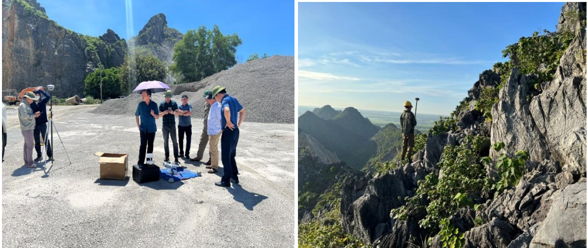
Photo: North Central Geological Federation conducts appraisal of the volume of minerals mined at Hao mountain mine, Nga An commune, Nga Son district, Thanh Hoa province (According to Referendum Decision No. 737/QĐ-CSKT dated December 22 December 2022 of the Police Investigation Agency of Thanh Hoa Provincial Police)