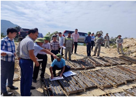
Photo: Checking the construction progress of the Dong Ri coal mine exploration project in October 2023