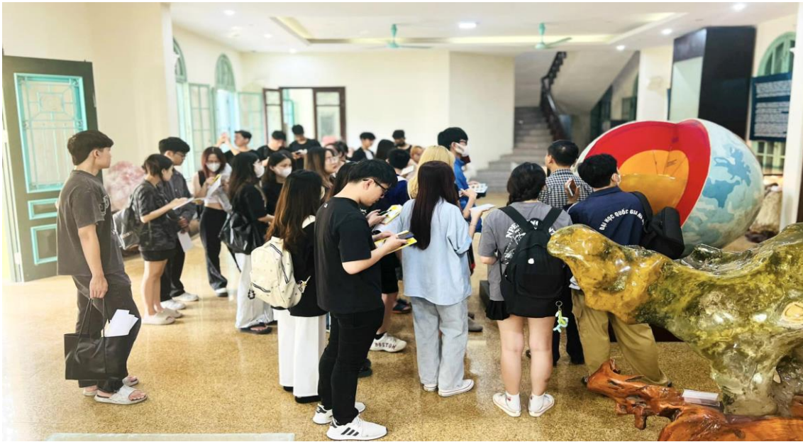
Photo: Students of Hanoi National University visit the Museum