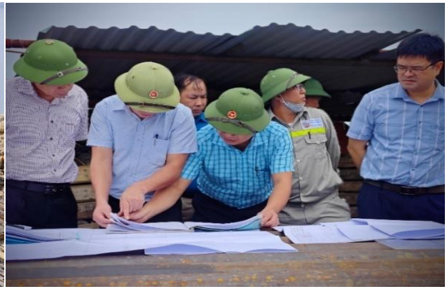
Photo: Checking the construction progress of the Bao Dai coal mine exploration project in October 2023

The Department has guided, monitored and transferred the results of monitoring exploration projects to the Office of the National Mineral Reserve Evaluation Council as a basis for appraisal and approval of reserves.