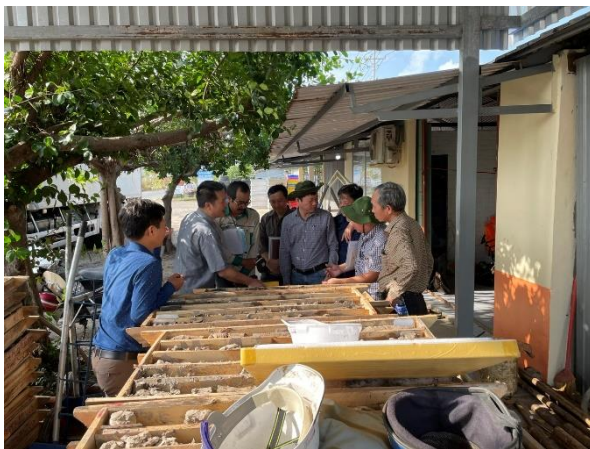
Photo: Checking the machine drilling work of Project 47-DCCT in the key investigation area of Ca Mau..

c) Project "Investigation and assessment of geological structure characteristics, engineering geology, proposal of solutions for exploitation and use of territory to serve the construction and development of infrastructure along Vietnam's coastline" (DCCT-47): The project has completed the entire volume of field construction work items and prepared a summary report. Main results: Investigated and determined the geological structure characteristics and geological characteristics of the coastal strip of Vietnam; Established a set of geological structure maps, engineering geology and engineering geology zoning at a scale of 1:100,000 for the entire coastal strip of Vietnam ( coastal land and shallow coastal sea ); evaluated the characteristics of geological structure, engineering geology, and engineering geological zoning for 4 key regions: Nam Dinh, Thanh Hoa, Quang Tri and Ca Mau at a scale of 1:25,000; proposed planning orientations for using the coastal strip territory in accordance with the geological conditions of the project.