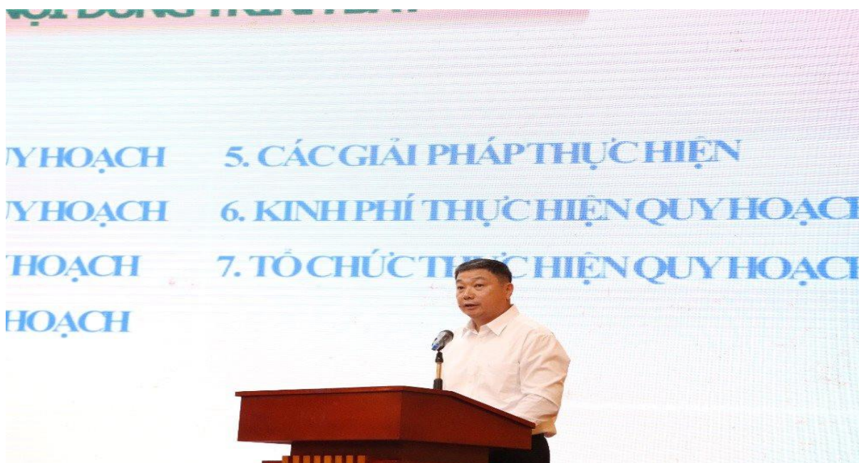
Photo: Mr. Tran Binh Trong, Director of the Vietnam Geology Department, introduces the main content of the Plan

At the same time, focus on investigating and evaluating strategic and important minerals; Investigating geological hazards to respond to climate change, investigating urban geology, environmental geology, and geological heritage; Statistics, inventory, and full accounting of the value of national mineral resources. Strengthen the application of scientific and technological advances, digital transformation, build a database system, geological and mineral information, and synchronously integrate with national and local geographic databases. General data of the natural resources and environment sector, ensuring compliance with the e-Government Architecture of the natural resources and environment sector.