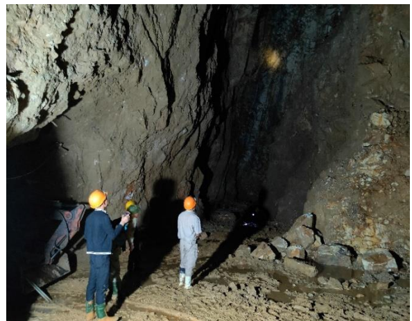
Photo: North Central Geological Federation surveys and studies tin ore in marble in Chau Hong commune, Quy Hop district, Nghe An province under the component project: Investigation and evaluation of tin - tungsten ore on the terrain Nghe An province table

b) Project "Magnetic-gravity measurement at scale 1:250,000 of Vietnam's seas and islands": In 2023, the final report has been completed and submitted to the Ministry for approval 6 . As a result of the project, the volume of work items of magnetic and gravity measurement flights at the scale of 1:250,000 has been completed with an area of 268,768 km 2 ; Collect, synthesize, process, and analyze geophysical data to create geological structure maps based on geophysical data, zoning diagrams to predict