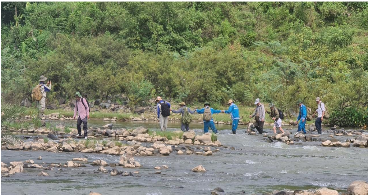
Photo: Field inspection of the Project "Investigation and assessment of the current status of the radioactive environment in some areas with radioactive anomalies in the provinces of Kon Tum, Gia Lai and Lam Dong, proposing solutions to reduce Minimize the harmful effects of the radioactive environment" in Sa Thay province, Kon Tum province by the Southern Geological Mapping Federation

been completed and submitted to the Ministry for approval of the final report. As a result, a set of natural radioactive environment maps at a scale of 1:250,000 was established for 15 northern border and coastal provinces: Lang Son, Cao Bang, Ha Giang, Lao Cai, Lai Chau, Dien Bien, Thai Binh, Nam Dinh, Ninh Binh, Thanh Hoa, Nghe An, Ha Tinh, Quang Binh, Quang Tri, Thua Thien Hue. The typical values of schools and different school regions of the provinces have been determined; established a set of background data on the radioactive environment at a number of key locations according to the results of radioactive environment monitoring in 10 provinces; Establish a common database for projects, for each province, to help environmental managers and protectors have an overview of the radioactive environment to plan and build projects to serve the national economy of the province. and is also a database to compare radioactive environment values when there are environmental impacts and incidents.