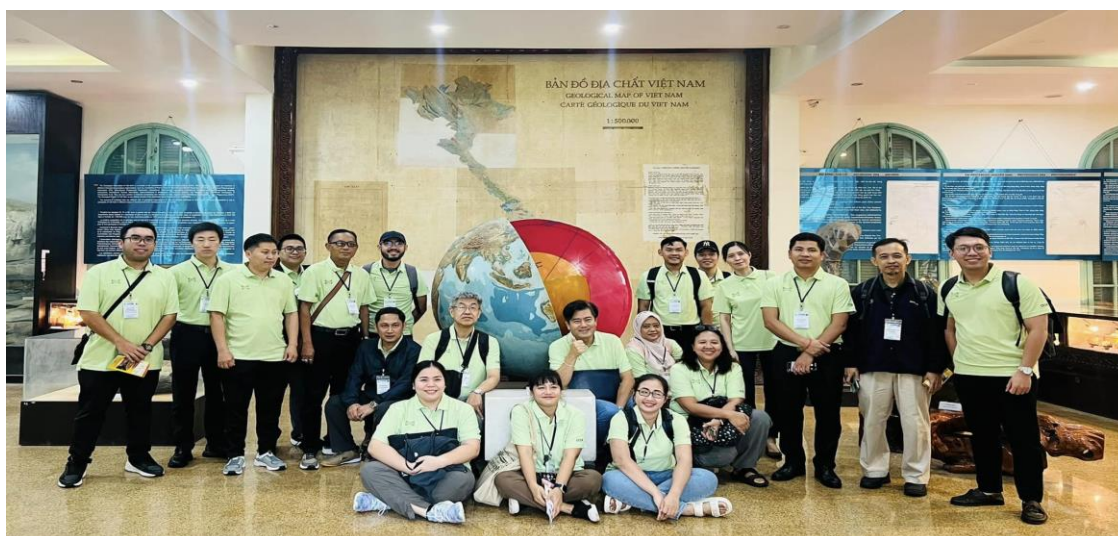
Photo: Member of the Coordinating Committee for East and Southeast Asia Geoscience Programs, Korean Institute of Geoscience and Mineral Resources visited and took souvenir photos at the Museum

Coming to the Museum of Geology are not only researchers and specialized students, but also many schools at all levels that bring students to learn about the Earth and our country's mineral potential. The Museum's interpretation team has developed and put into operation many experience programs for different visitors. Activities "I'm a little Geologist", "Treasure hunt" for elementary school students; The activity "Test making fossils" is suitable for high school students, etc.