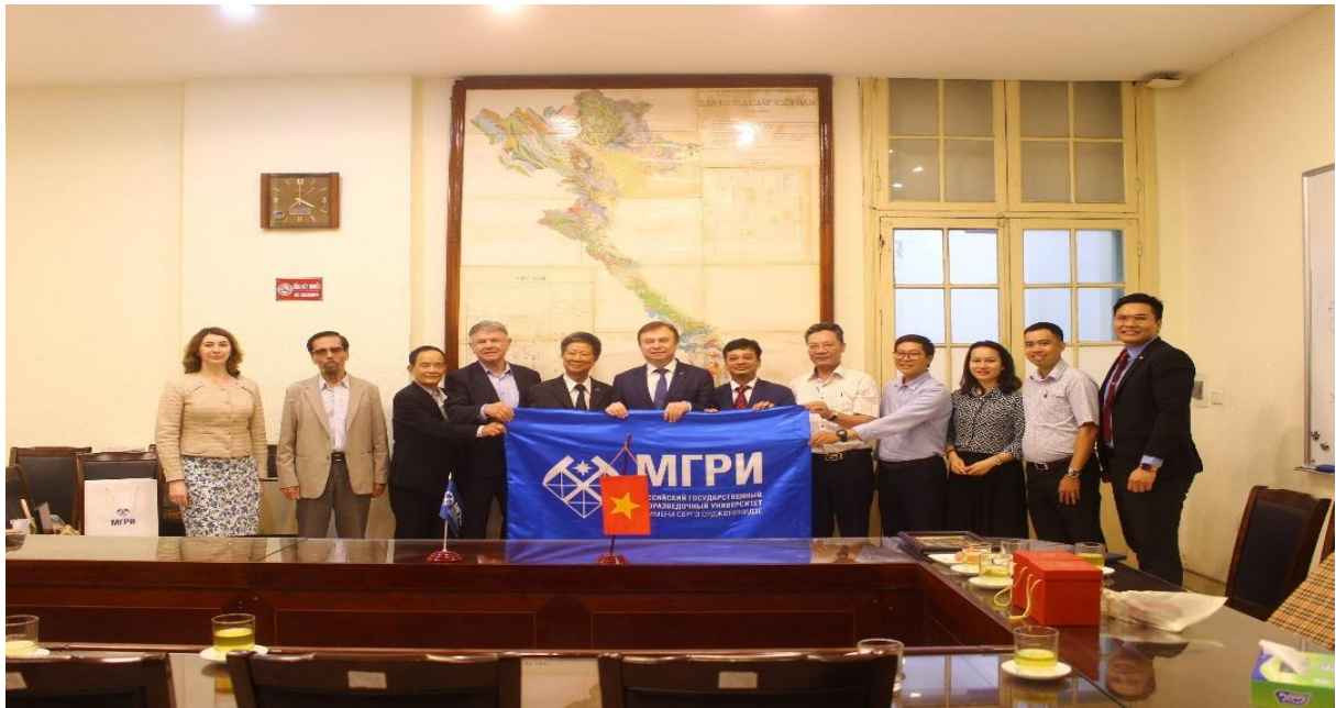
Photo: Receiving and working with the University of Geological Exploration in Moscow,