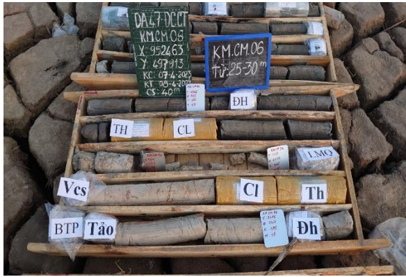
Photo: Machine drill core sample of Project 47-DCCT to construct the key investigation area of Ca Mau