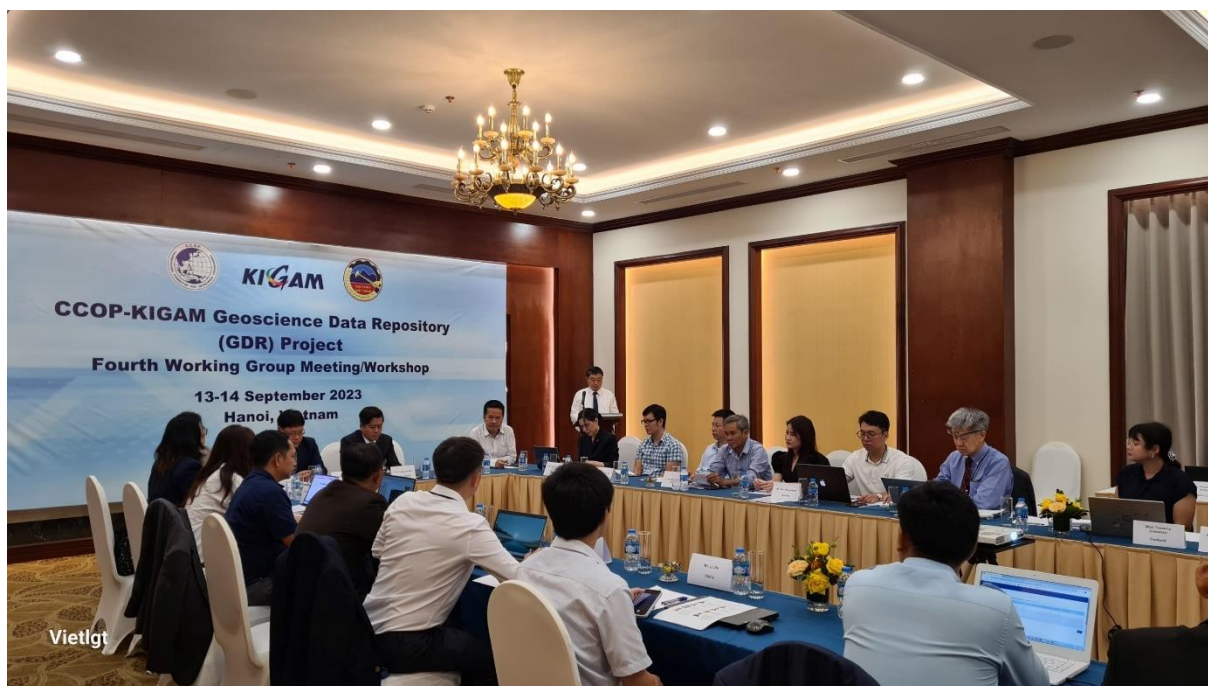
Photo: Training workshop on CCOP-KIGAM geoscience data archive

In 2023, the Department will promote bilateral cooperation with strategic partners in the field of geology; Attended the 12th China-ASEAN Mining Cooperation Forum (CAMCF) Conference; coordinate with the Australian Embassy on cooperation in developing the Geology and Mineral Law project (geology part), with the US Embassy on cooperation in the field of Geology; develop plans and organize seminars on the results of the project to establish a geological database in Vietnam within the framework of the CCOP-KIGAM project; Cooperate with CCOP on geological projects.