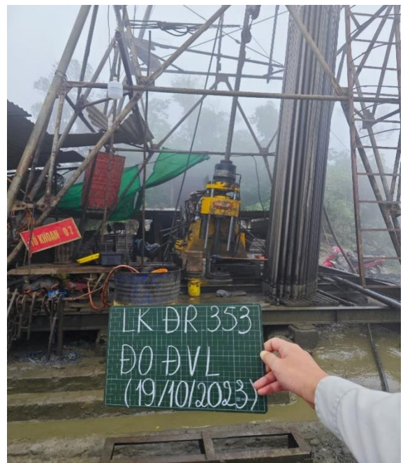
Photo: Monitoring drill hole Karota measurement of Dong Ri coal mine exploration project (Geological Analysis and Verification Center)