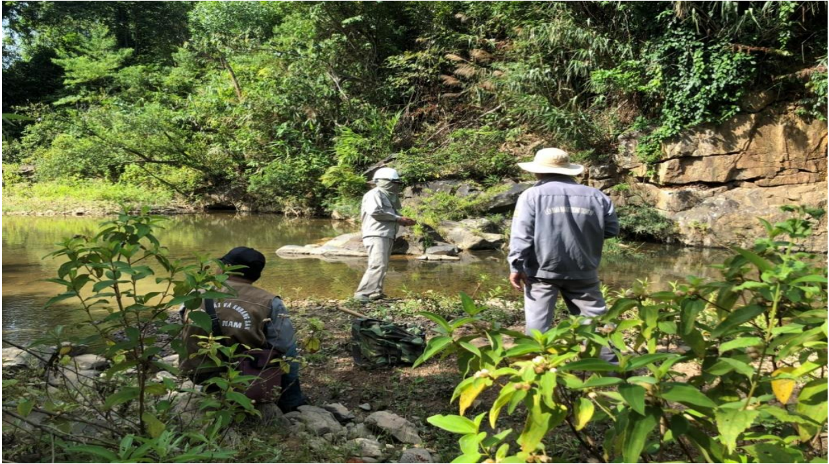
Photo: Geological roadmap Project "Investigation, assessment and establishment of a set of toxic mineral environment maps in the territory of Vietnam (mainland part - phase I)"

- Project "Investigation and assessment of the current status of the radioactive environment in some anomalous areas in the provinces of Kon Tum, Gia Lai and Lam Dong, proposing solutions to minimize the harmful effects of the radioactive environment ”: Completed the preparation of a summary report approved by the Appraisal Council. Results of radioactive environment investigation, scale 1:25,000 in 21 areas, with a total area of 250 km 2 in the provinces of Kon Tum, Gia Lai and Lam Dong; Establish a set of maps including: Environmental geological map, gamma and environmental radioactive gas dose rate map, total annual equivalent radiation dose map and preliminary delineation of environmental monitoring and control rates. 1:25,000 across all 21 investigation areas. Delineate a total area of 7.35 km 2 with a total dose equivalent to natural irradiation from 7 ÷ 16.8 mSv/year at high levels, distributed in areas of Kon Ray, Dak Ha, Sa Thay districts, Kon province Tum and a small area in Ward 4, Da Lat city, Lam Dong province. The process of measuring and mapping the radioactive environment combined with sampling and analysis of rare earth minerals, thereby discovering promising areas of ion-absorbing rare earth minerals in the Dak Ui and Sa areas. Mr. Kon Tum province to continue investigating and evaluating.