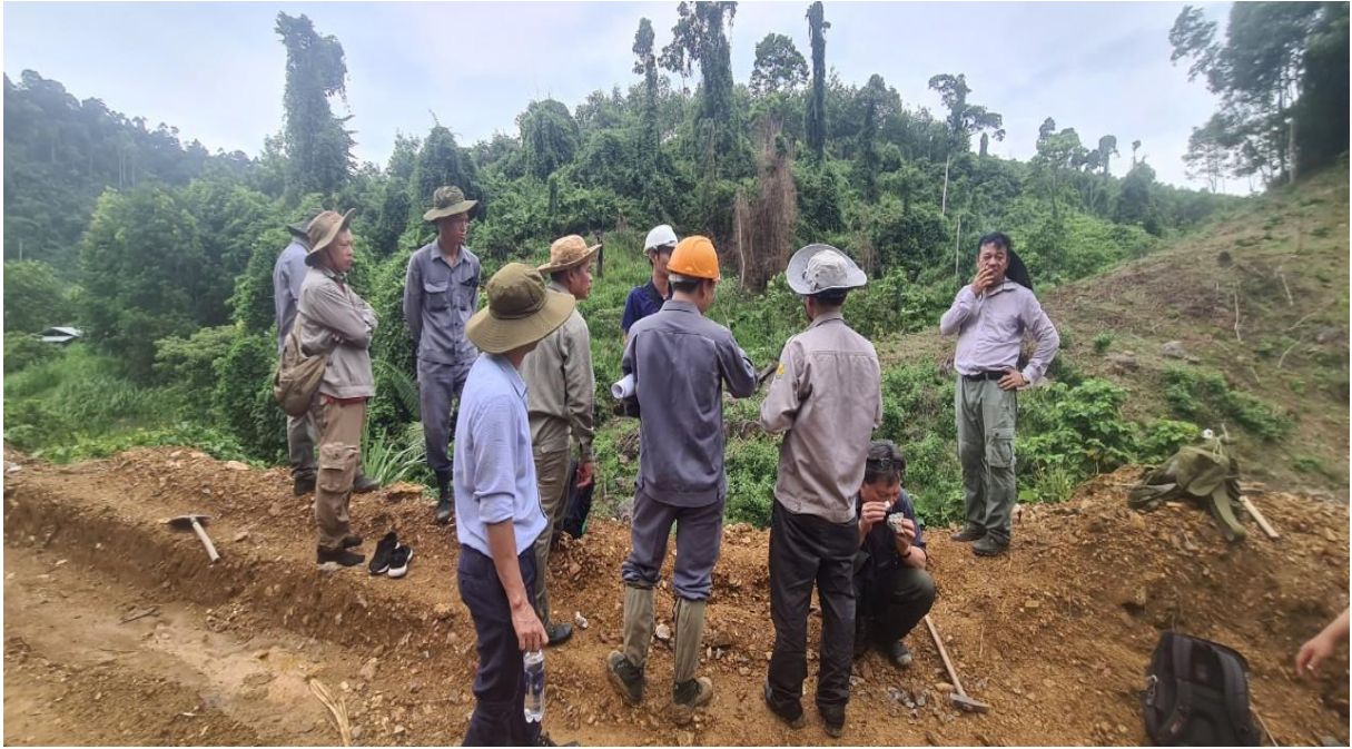
Photo: Field inspection of gold ore in Phuoc Xuan, Quang Nam province of the metal component project under the project: "Overall assessment of mineral potential in the Central Central region to serve socio-economic development"

e) Project "Evaluating mineral resources, serving sea sand exploitation, meeting the need for leveling highway projects and transport and urban infrastructure projects in the Mekong Delta": Determined The sand distribution area is 160.3 km 2 , average thickness is 4.3 m, mainly composed of fine-grained sand, average total sand content is 82.8%. Estimated resources of level 333 + level 222 reach 680 million m 3 , of which resource level 222 is 145 million m 3 . An area of 32 km 2 with a resource of 145 million m 3 , 20-30 km from the shore, has been selected, eligible for transfer and exploitation.