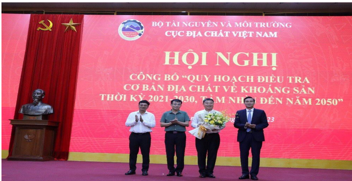
Photo: Deputy Minister, Ministry of Natural Resources and Environment Tran Quy Kien congratulated the Vietnam Geology Department on completing and implementing the planning effectively

Vision to 2050, based on the results achieved by 2030, the Plan will be adjusted and the remaining tasks of the Plan will be implemented. Specifically, complete the survey to create mineral geological maps at a scale of 1:50,000, and evaluate minerals in the remaining prospective areas on the mainland; detect and investigate minerals in Vietnamese waters; Complete additional investigation, update and complete the urban geological database at a scale of 1:25,000 to serve the socio-economic development planning of cities; Investigate and create multi-objective geochemical maps and detailed geological hazard warnings for provinces in the mountainous, midland and coastal areas; Environmental geological investigation to serve environmental improvement and restoration after mineral exploitation.