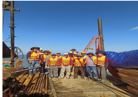
Photo: Checking the offshore drilling work of Project 47-DCCT in the shallow coastal area of Ca Mau.

d) Project "Overall assessment of mineral potential in the Central Central region to serve socio-economic development": The project faces many difficulties in arranging annual funding and implementation during the outbreak of the pandemic, the Department promptly directed to focus on construction in areas with favorable geological conditions, promptly adjusting large-scale current status investigations when construction conditions allowed. By 2023, although the budget reaches 12% of the total budget, the project has had many new discoveries of some promising ore sites: Copper in Kon Ray, Kon Tum; gold in Sa Thay ( Kon Tum ), Phuoc Son, Nam Giang ( Quang Nam ), etc. In particular, the large-scale copper ore and associated mineral resources have been evaluated, enough to form a smelting industrial area needles in Kon Ray and Kon Tum areas. The area has been added to the Planning for mineral exploration, exploitation and processing approved by the Prime Minister in Decision No. 866/QD-TTg dated July 18, 2023. Accordingly, the planning has determined Kon Ray region is a mining industry development area with an interconnected complex from mineral exploitation to metallurgy.