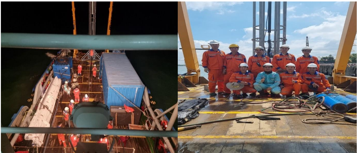
Photo: Federation of Geophysics constructing several samples with a vibrating tube under the Sea Sand Project

Preliminary forecasts of impacts according to exploitation scenarios based on the prediction model of wave propagation to the shore show that the impact of exploitation activities on the coastal zone is insignificant ( ocean waves increase from 2 to 4 cm ). Completed and submitted to the Ministry for approval the Report on the assessment of sea sand mineral resources in area B1 and participated in transferring the results to the People's Committee of Soc Trang province.